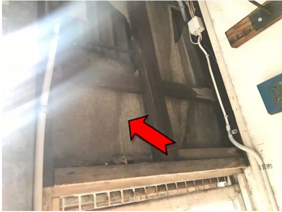
Photo 1. Interior, ground level, paper store, east wall panels – asbestos-containing fibre cement sheeting.