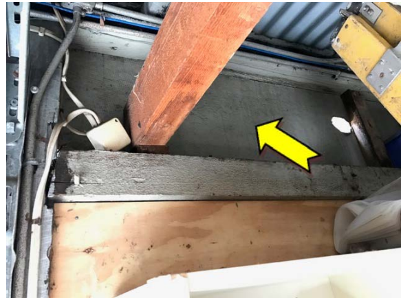
Photo 4. Interior, gardeners shed, west elevation, wall – suspected lead-containing beige upper paint system.