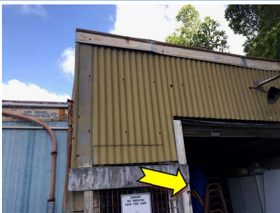
Photo 5. Exterior, throughout, window and door frames – suspected lead-containing beige upper paint system.