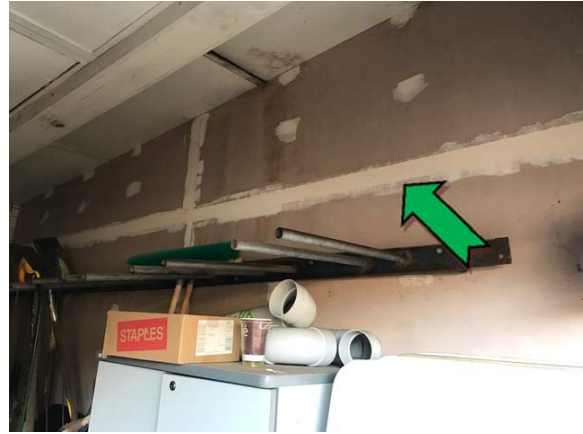
Photo 2. Interior, ground level, paper store, north wall panels – non asbestos-containing fibre cement sheeting.